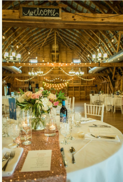
Rose Gold Sequin Runner 1801