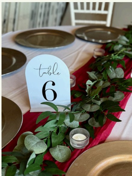
Black and White Acrylic Arch 2203