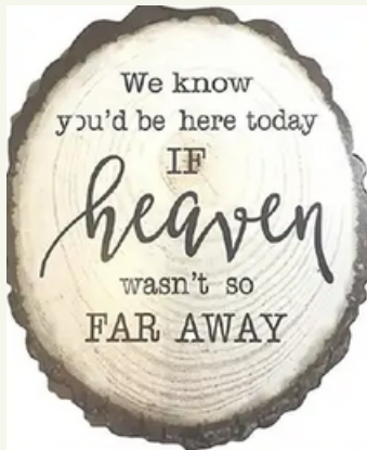
In Memory 2106.A