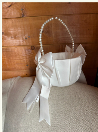
Flower Girl Baskets (2) 1504