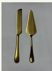
Gold Knife Set 1604.A