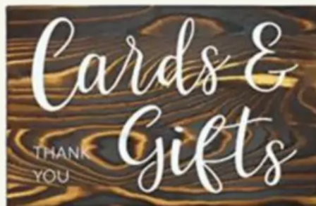
Cards & Gifts 1303 *Matches with 1302