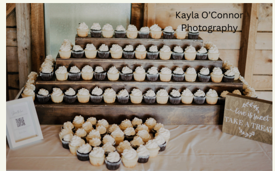
Tiered Cupcake Stand 1605