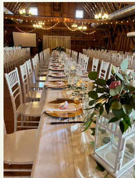
White Lanterns 2008