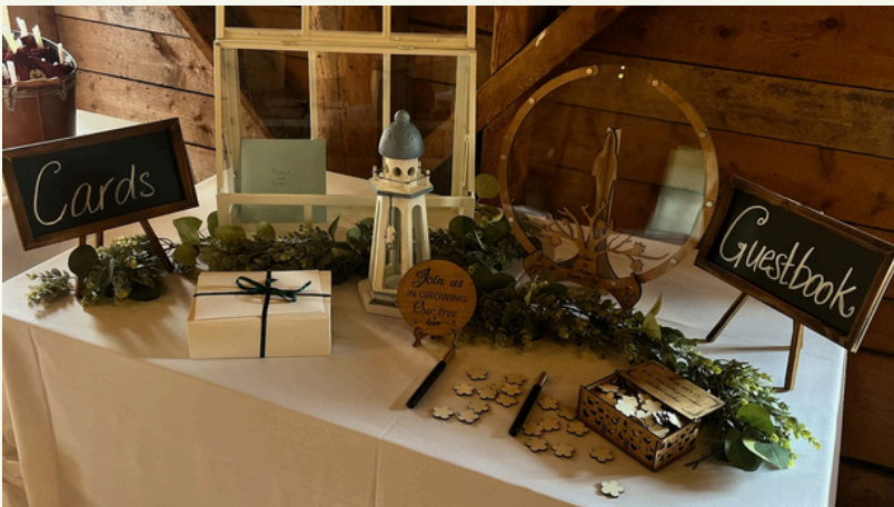
Cards and Guestbook Chalkboards 1300