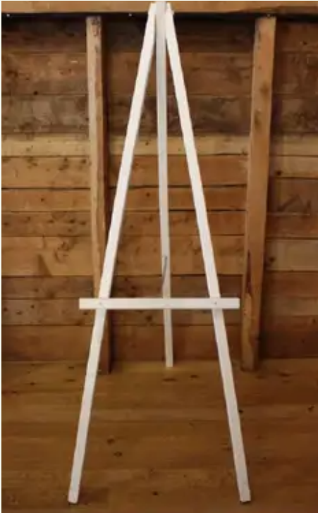
Tall White Easel 1700