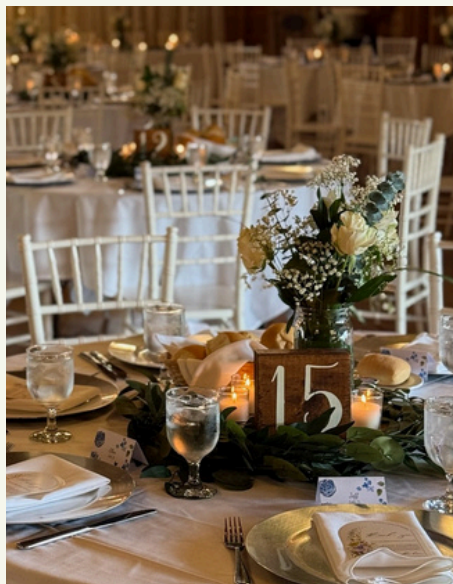
Square Numbers 2201