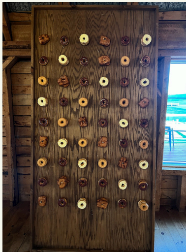
Donut Wall 1601