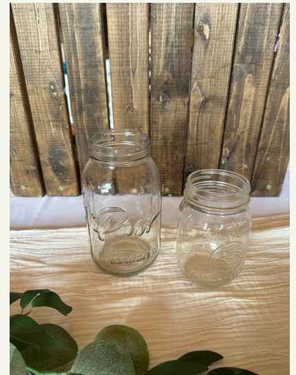
Mason Jars 2305