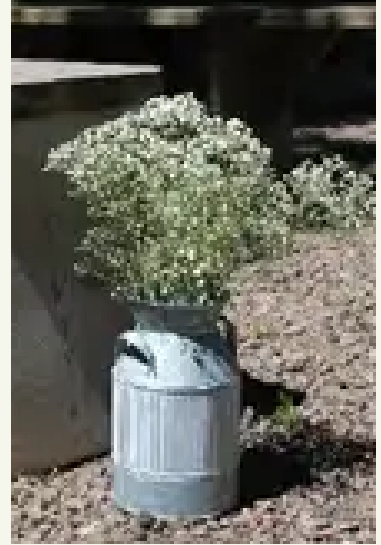
Metal Milk Jug 2302