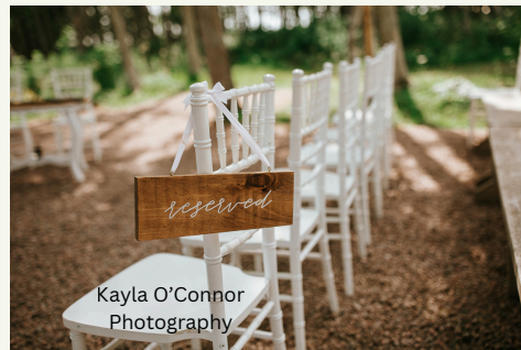
Reserved Signs (2) 1501