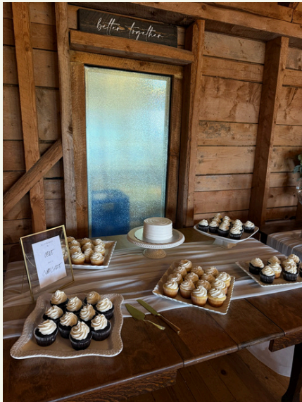
White Cake Stands 1600