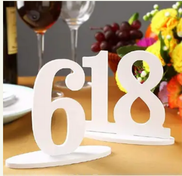
White Numbers 2207