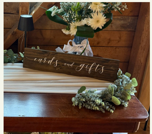
Dark Stain Cards and Gifts 1304