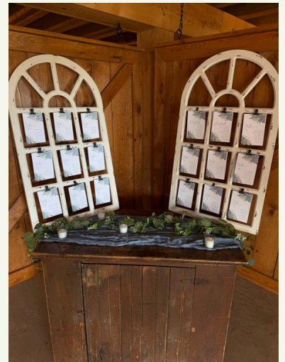
White Window Frames 2002