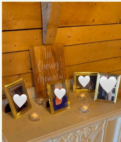
Gold Frames 5x7 1902