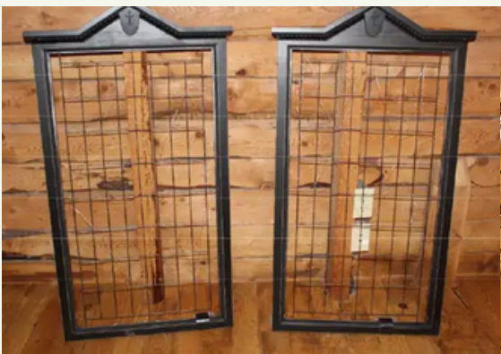
Black Wire Frames 2003