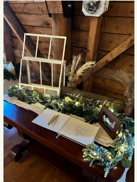
White Cardbox 1202