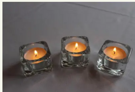
Square Tealights 1104