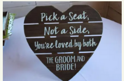
Pick a Seat Heart 1502