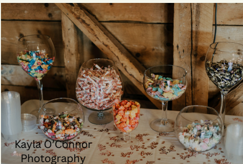
Candy Bar 1603