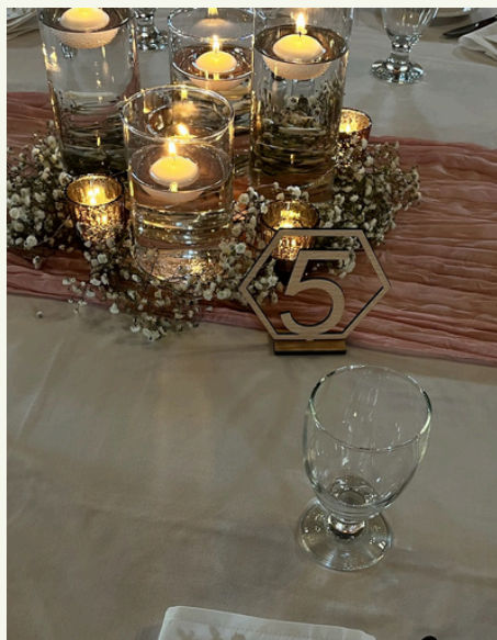
Faux Wood Hexagon 2204