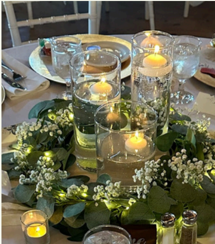
3 Tier Floating Candles 1100