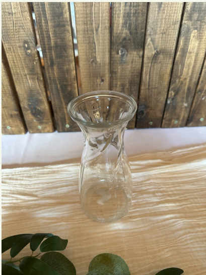
Milk Jug Vase 2303