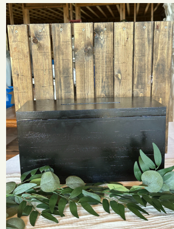
Black Wooden 1204