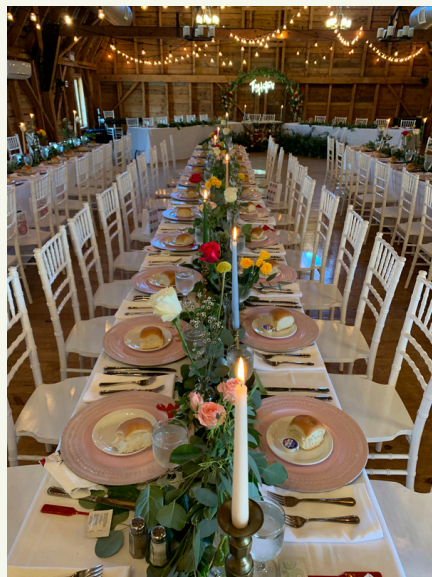
Pink Charger Plate 2010