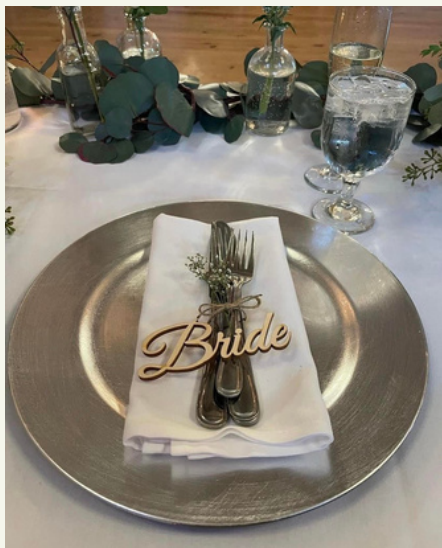
Silver Charger Plate 2009