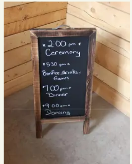
Double Sided Chalkboard 2107