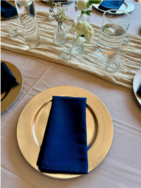
Navy Blue Napkins 1800