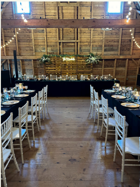
Black Table Linen 1803