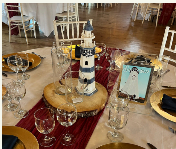
Wooden Cookie 1400