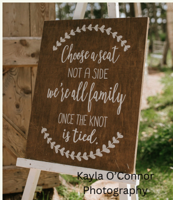
Choose a Seat 1500