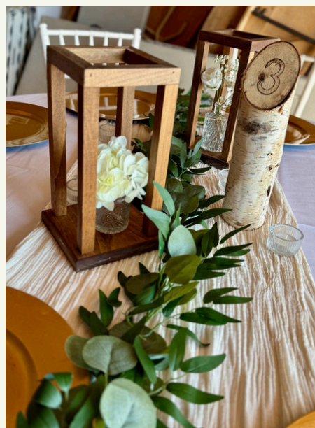
Birch Numbers 2209