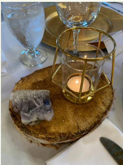
Gold Geometric Tealights 1103