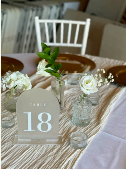
Bud Vases 2300