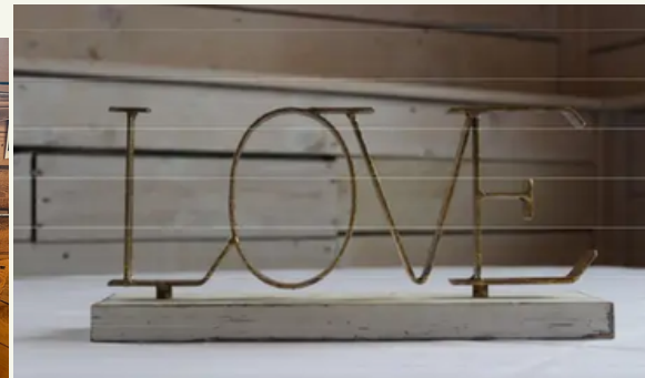
Tabletop Gold LOVE 2005