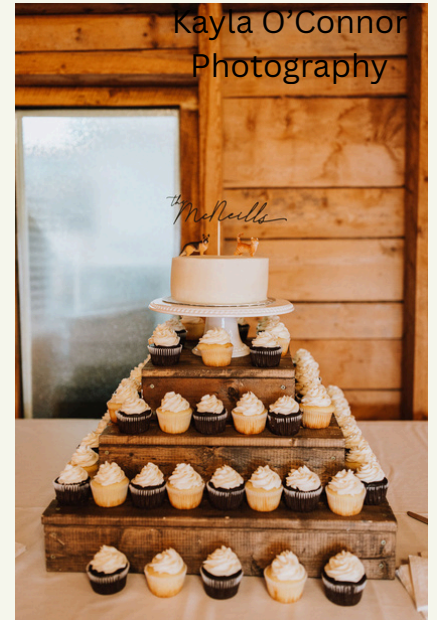
Pallet Cupcake Stand 1602