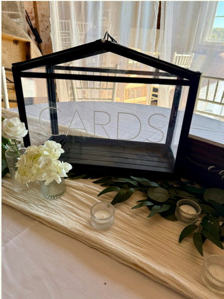
Black Cardbox 1200