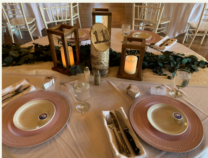
Wooden Lanterns Spaced 1402.A