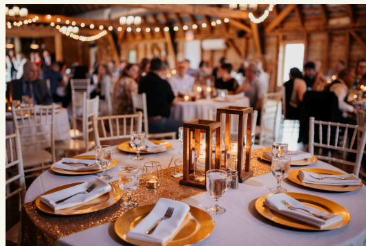
Gold Charger Plate 2011