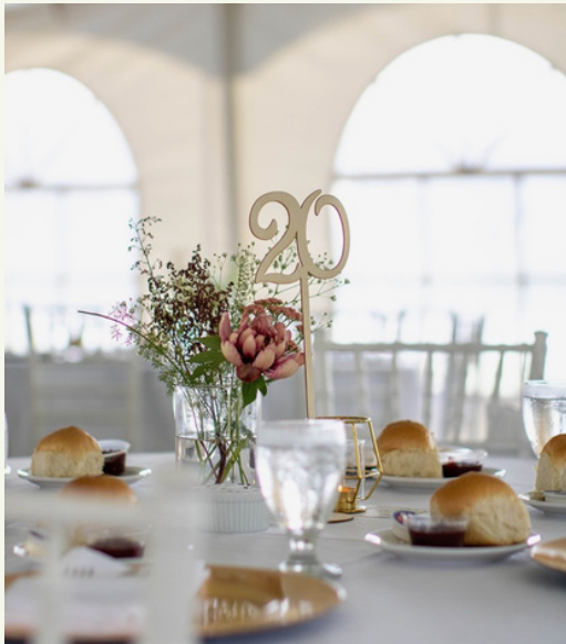
Tall Wood 2206