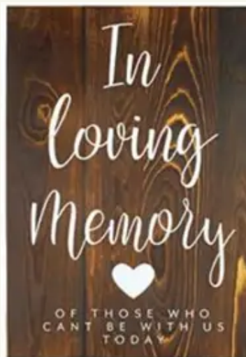
In Memory 2106.B