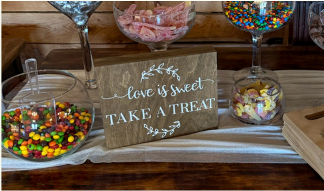
Love is Sweet, Take a Treat 2104