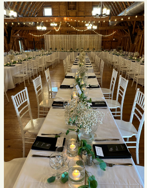
Black Napkins 1805

Note: White Linen and Napkins are default in every package.