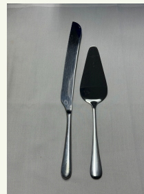
Silver Knife Set 1604.B