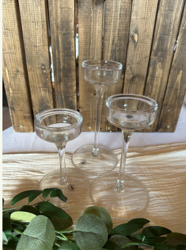
3 Tier Tealight Candles 1101

*Head table or side tables only as we have limited quantity