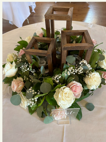
Wooden Lantern Cluster 1402.B

Note: Candles do not come with the lantern. Mason jars fit inside or fake pillar candles. Real candles need to be in something and not free standing.