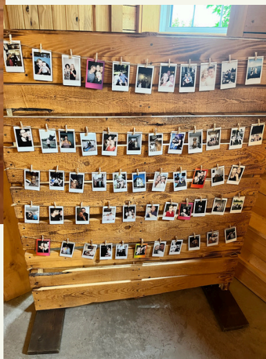
Pallet for Pictures/Seating Chart 2004