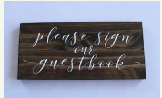
Guestbook 1301 *Matches with 1304