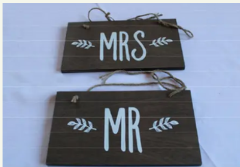
Mr & Mrs Chair Signs 2108