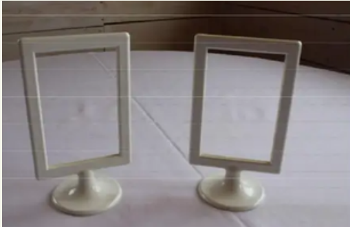
White Standing 4x6 1900