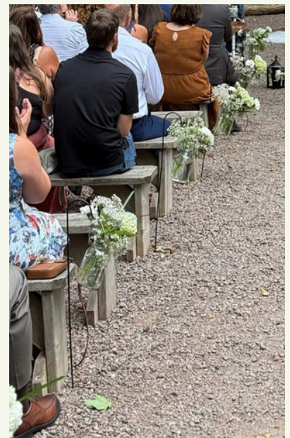
Shepard Hooks 1505