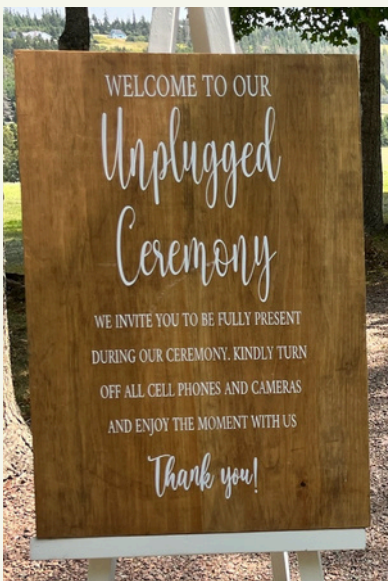
Unplugged Sign 1503