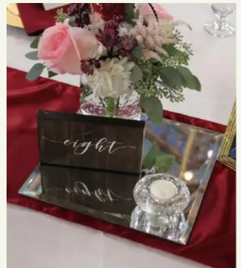
Diamond Tealights 1105