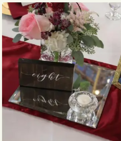
Square Mirror 1401