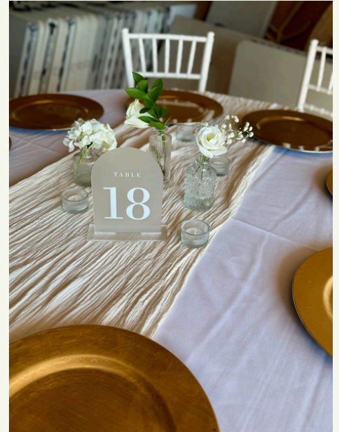
Cream Cheesecloth 1802