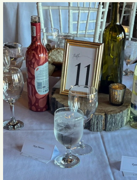
Gold Frame 2205