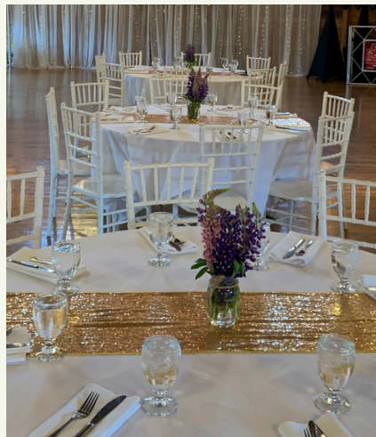
Gold Sequin Runner 1804