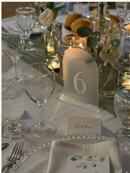
Frosted Acrylic Arch 2200