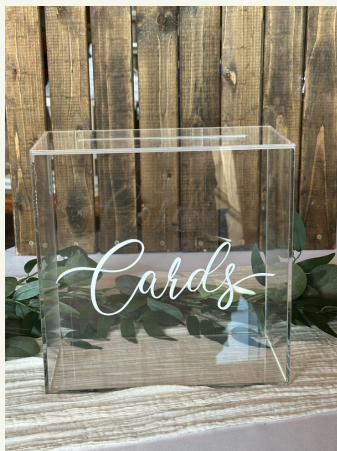
Clear Acrylic 1203