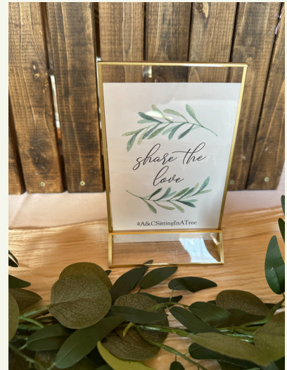
Gold Border 1901