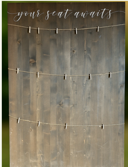
Your Seat Awaits 2001