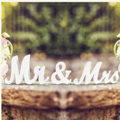
Tabletop Mr & Mrs 2006