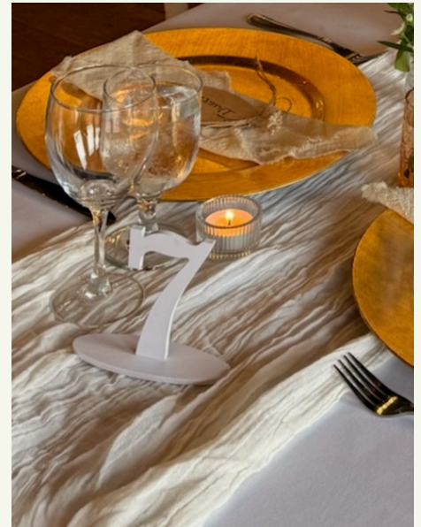
Circle Ribbed Tealights 1102

*Head table or side tables only as we have limited quantity