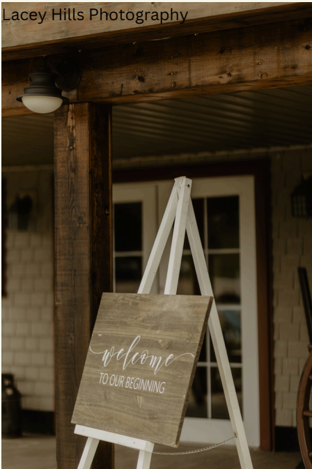
Welcome Sign 2000