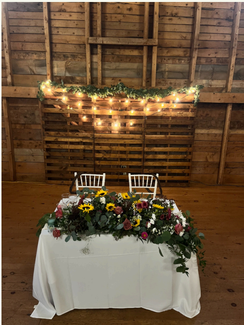
Pallet Backdrop 1010