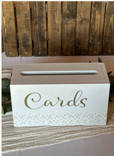
White and Gold 1201