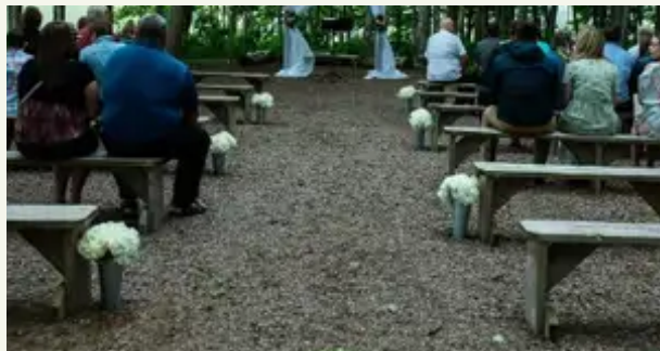
Tall Metal Tins 2304