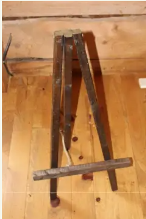
Short Brown Easel 1701