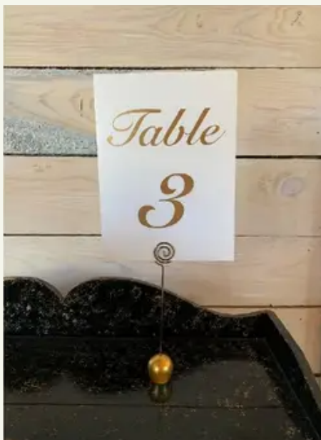
White and Gold Paper 2208