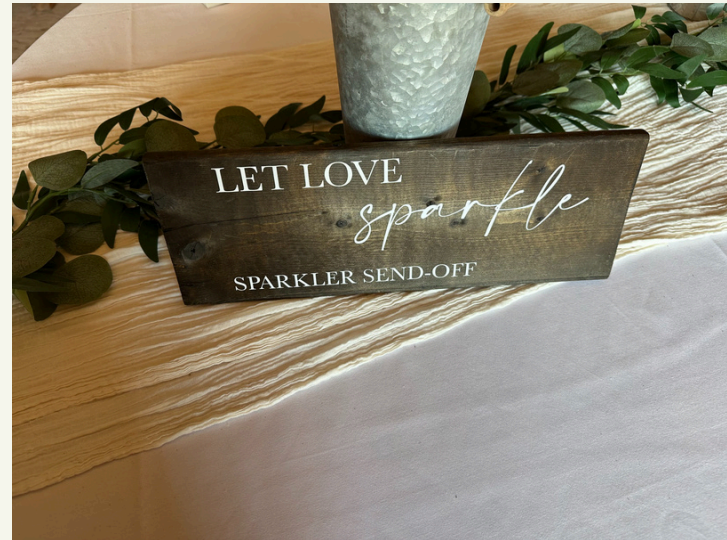
Sparkler Send Off 2105