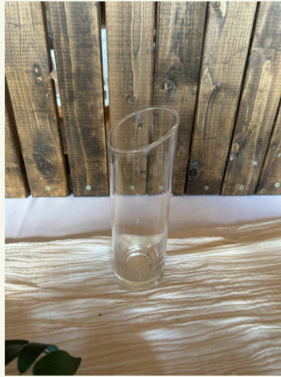
Slanted Small 2301