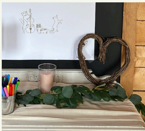
Wicker Hearts (2) 2007